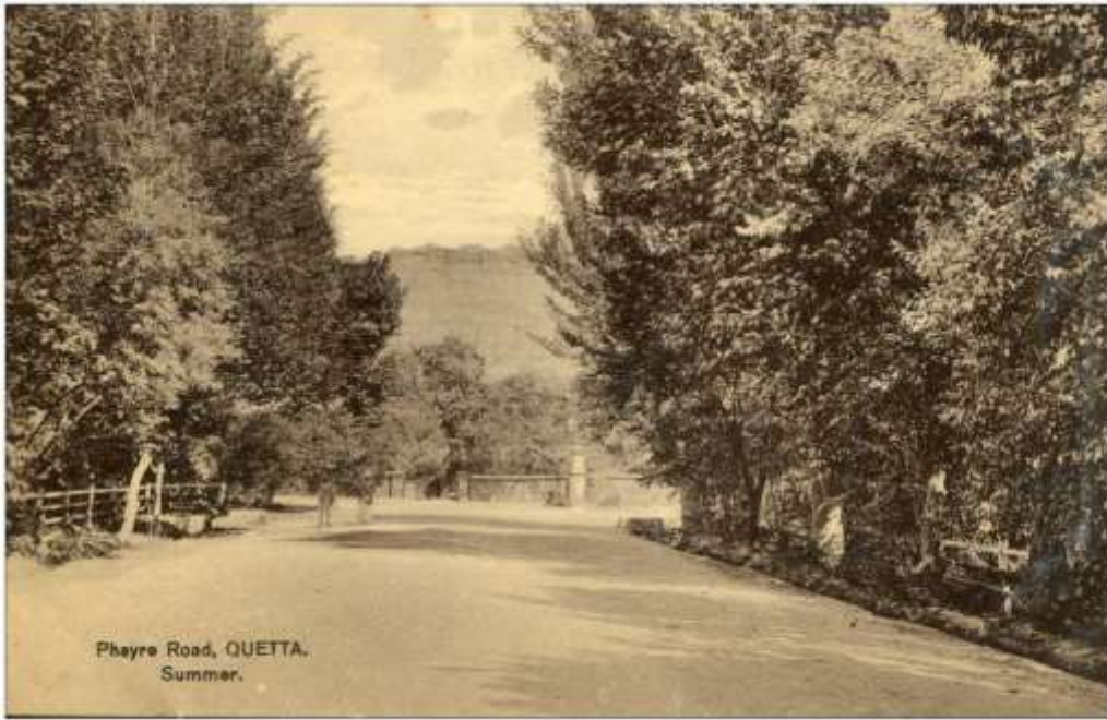
Phayre Road, QUETTA. Summer.