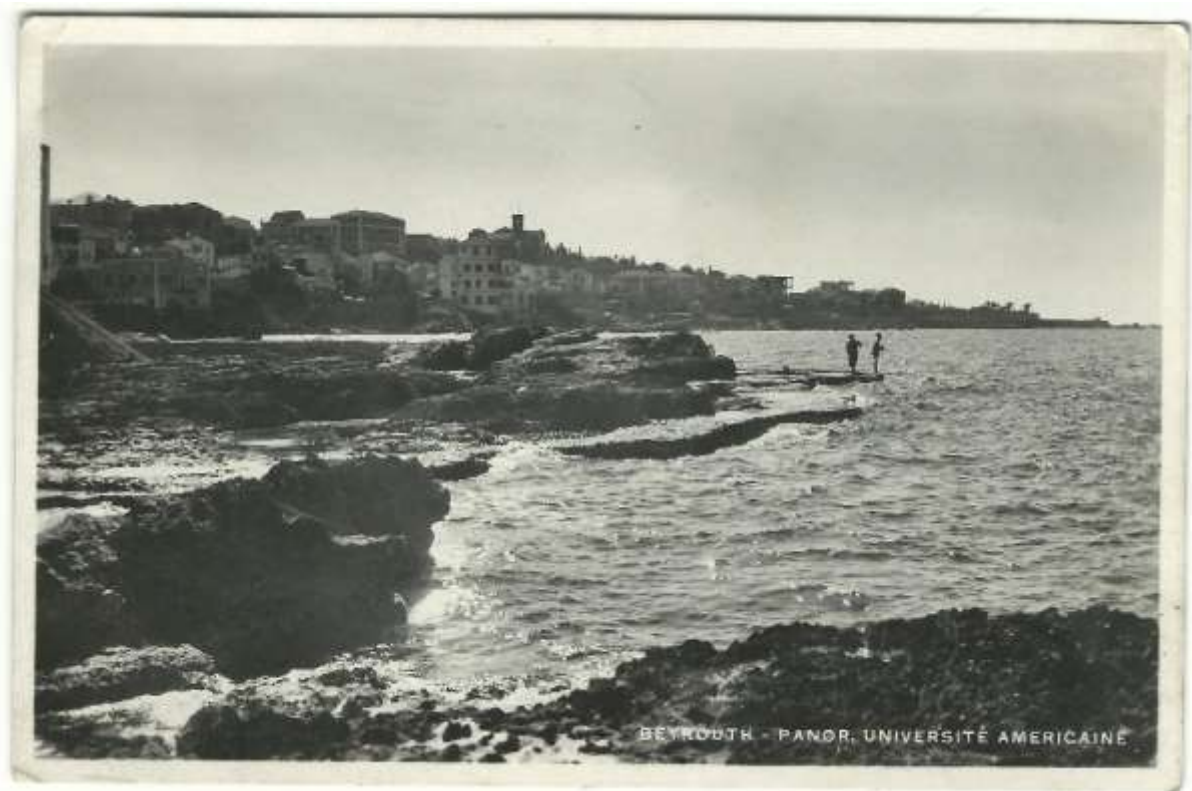
BEYROUTH - PANOR. UNIVERSITÉ AMERICAINE