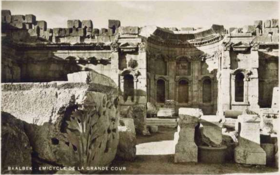
BAALBEK - EMICYCLE DE LA GRANDE COUR