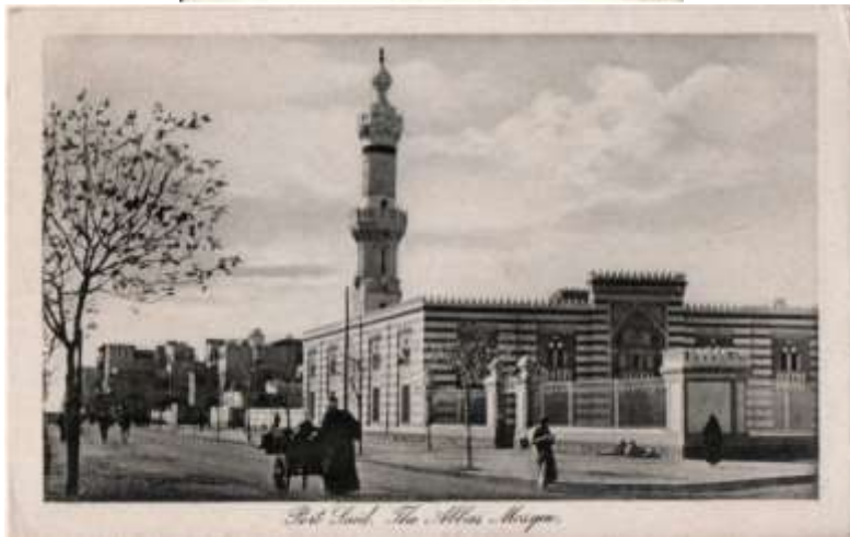
Post Card, The Abbas Mosque.