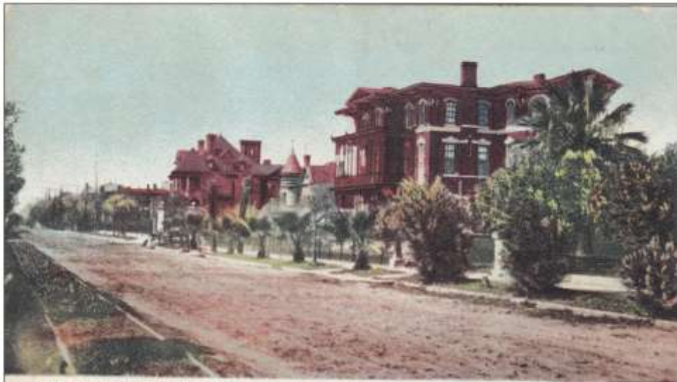
BROADWAY, GALVESTON, TEX.