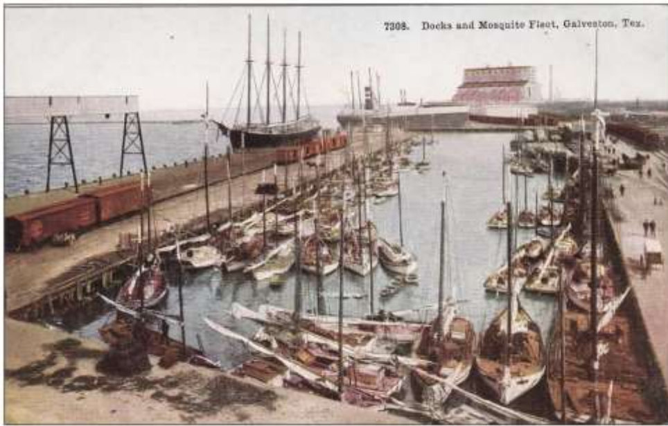
7303. Docks and Mosquito Fleet, Galveston, Tex.